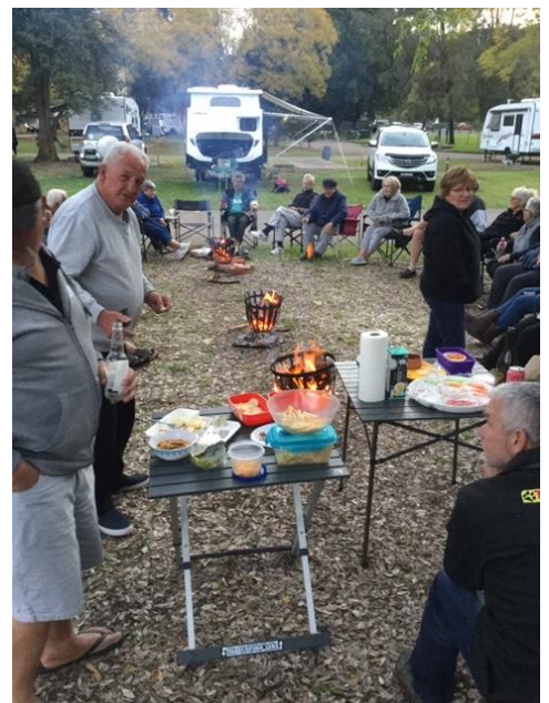
Fires at Del Rio