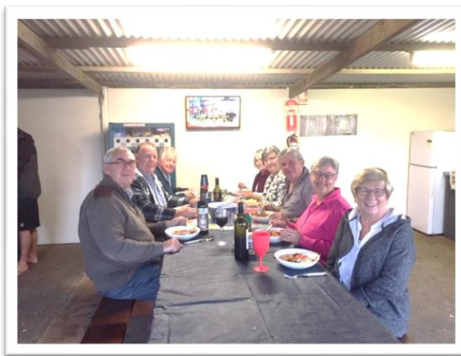
Dinner Port Fairy