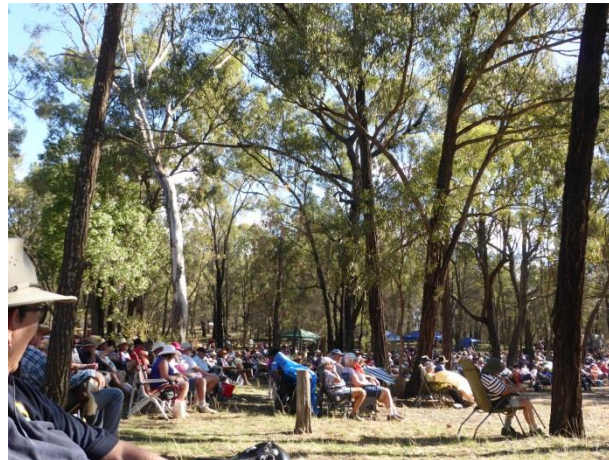
Small section of audience