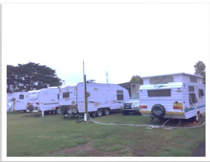
Above “Little Toot with the big vans”