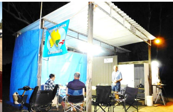
Shelter & Shed