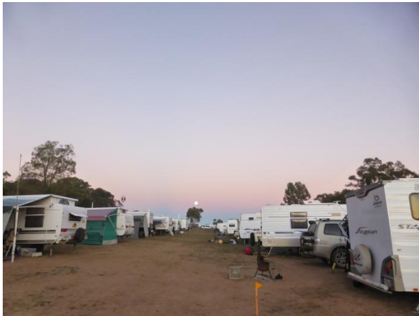
Moon in sky before sun up