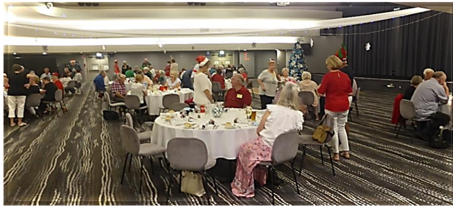
As you can see we had heaps of room even with 88 Members present